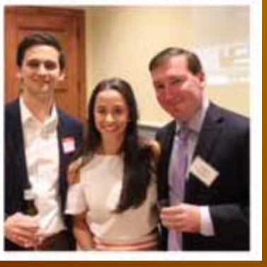
Co-sponsored by JYL and the Litigation Section of the MS Bar