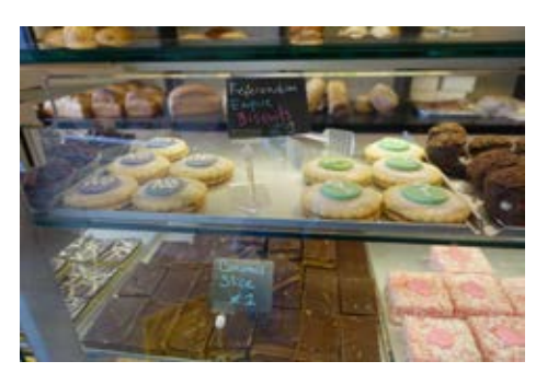
Referendum cookies for sale in Fife.

Their message was clear. The U.K. should be preserved, with Scotland a part of it, as they had known it. As their ancestors had known