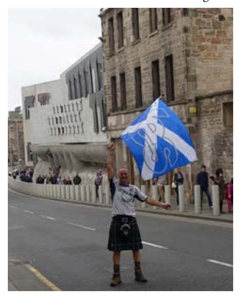
Enthusiastic YES man at Parliament building, Edinburgh.

In those last pre-referendum days, YES was far more prominent [like 20 to 1, or so] than NO in residential windows throughout